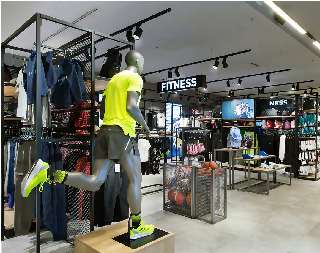
This allows innovations to be brought to market much