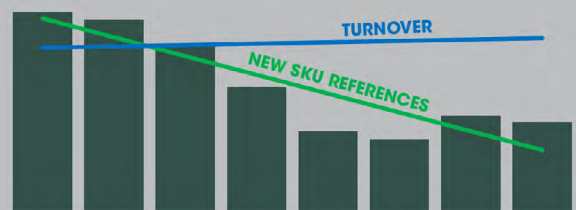
While sales continue to rise, Imola Retail Solutions has streamlined its product programme and thus achieved a high level of efficiency and sustainability