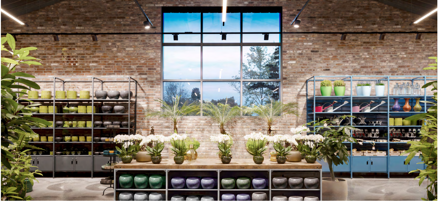
Imola Retail Solutions has established a leading international position with its holistic retail concepts