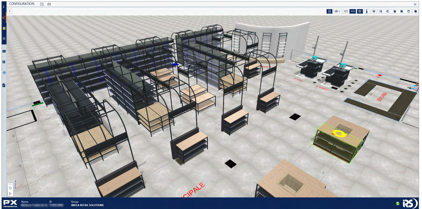
3D visualisations, perfect technical design and cost information guarantee successful customer presentations