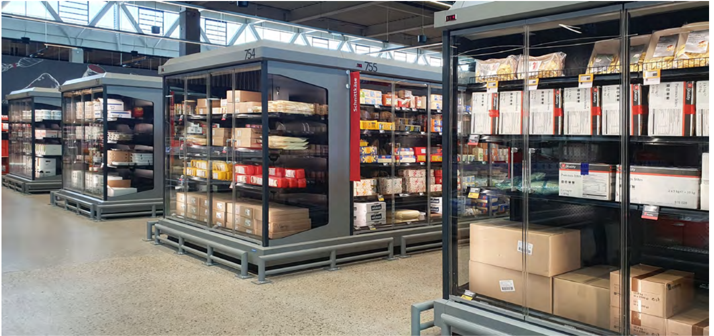
HAUSER's transparent refrigerated display cabinets are a highlight at the Transgourmet cash-and-carry market in Wals-Siezenheim, which opened in 2024