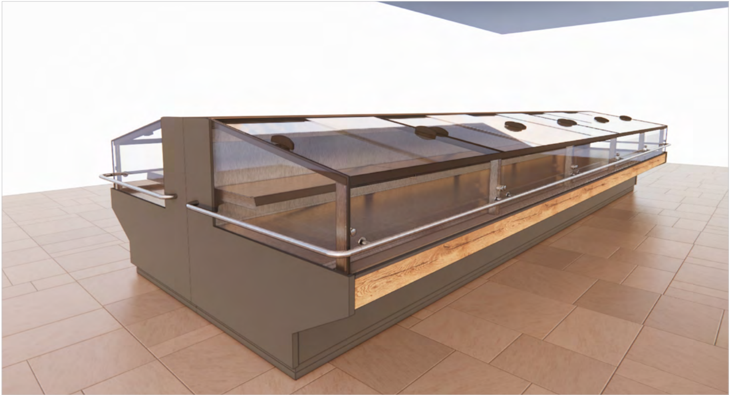
Perspectix's P'X Industry Solution is used to plan, configure, calculate, and present cooling systems

look rigid," says Gabriele Marsoun. "Now we have very user-friendly processes and only a few manual intermediate steps – everything work-seamlessly."