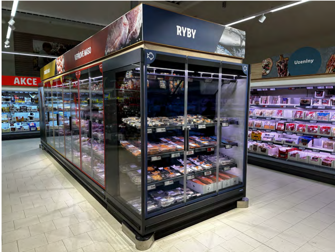
Hauser supplies food stores with customized equipment for refrigerated and frozen food displays